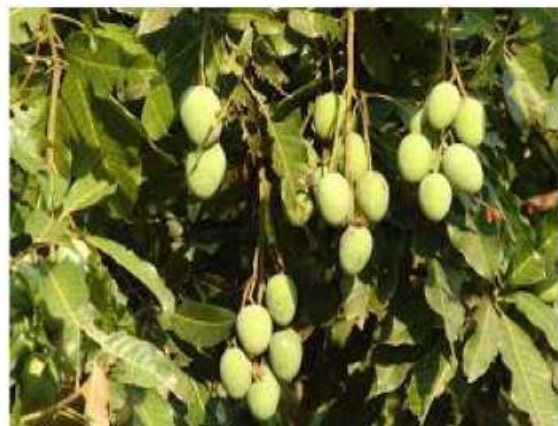
Figure 2. Variation of occlusion.