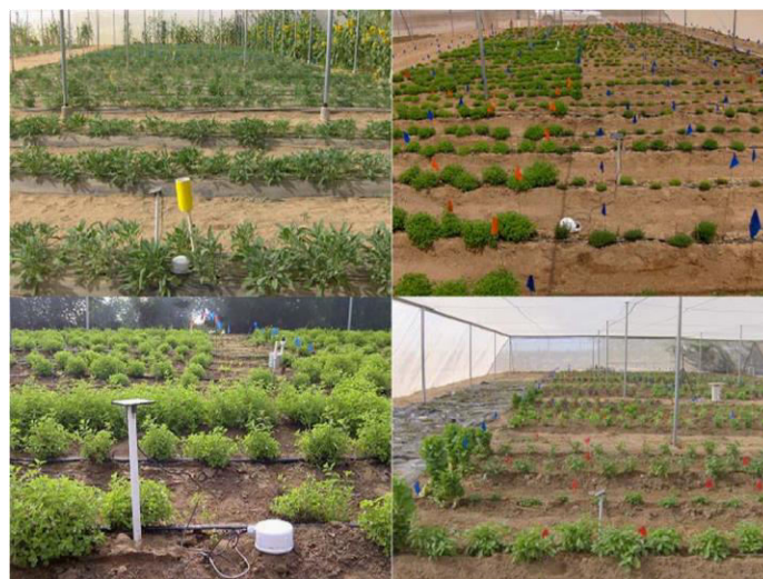
Fig.2.Some of the areas in which automated irrigation practiced.

At the same time all the farmers would not have the knowledge to use android developed applications. They feel it harder to use. And connecting to the internet may lead to the theft of data. So the privacy is also important to be maintained.